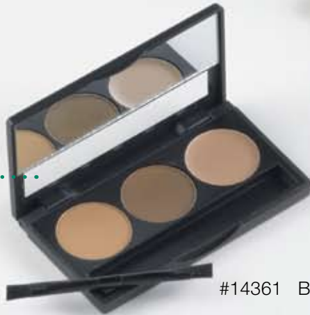
#14361 Blonde $18