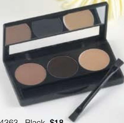
#14363 Black $18