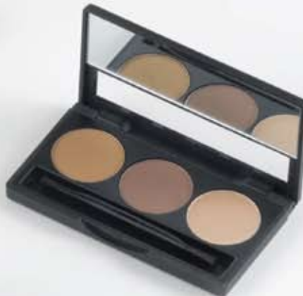
#14362 Brown $18