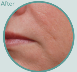
See firmer, smoother, younger-looking skin