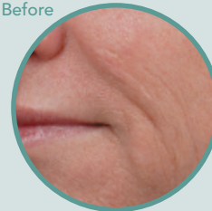
Deep lines and wrinkles