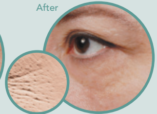
Your wrinkles and dark circles will virtually disappear